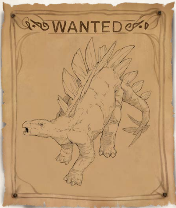
Stegosaurus Bounty Young Stegosaurus